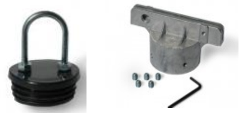
Loop Cap or Sign Adapter

Questions? Call 1-800-BOLLARDS (265-5273)