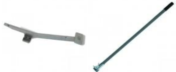
Short Removal Tool or Long Removal Tool