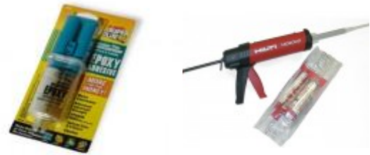
Single Use Epoxy or Epoxy Kit