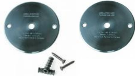
Asphalt Mounting Plate or Concrete Mounting Plate